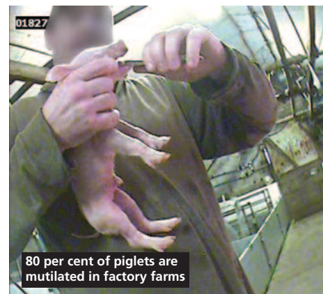
80 per cent of piglets are mutilated in factory farms