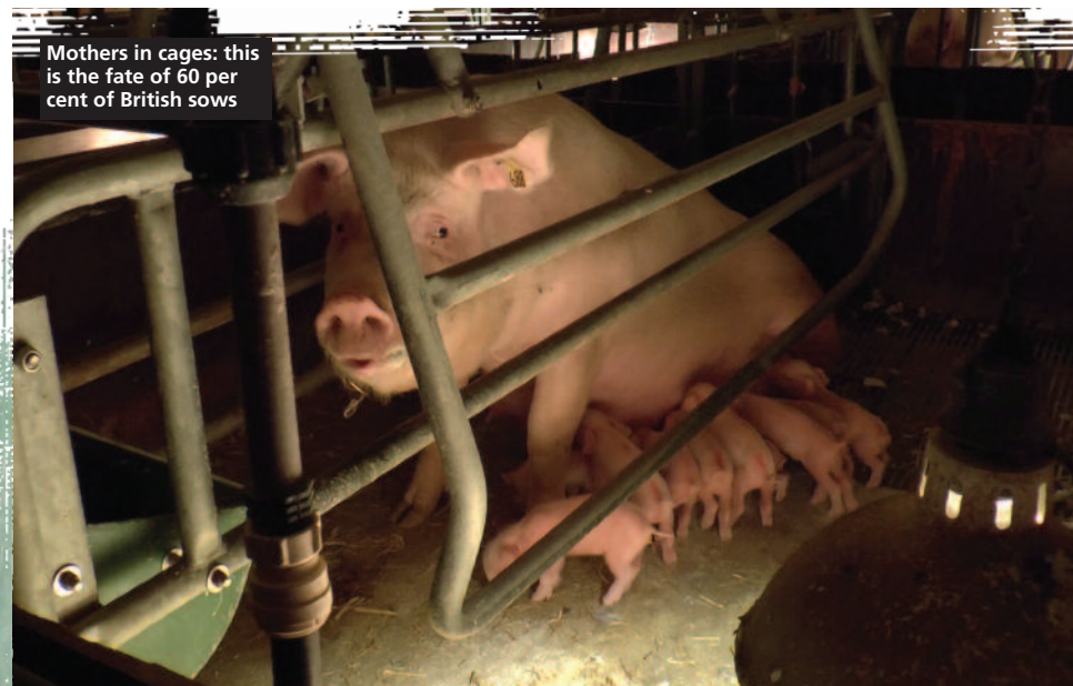
Mothers in cages: this is the fate of 60 per cent of British sows

Almost one-fifth of piglets do not survive until weaning