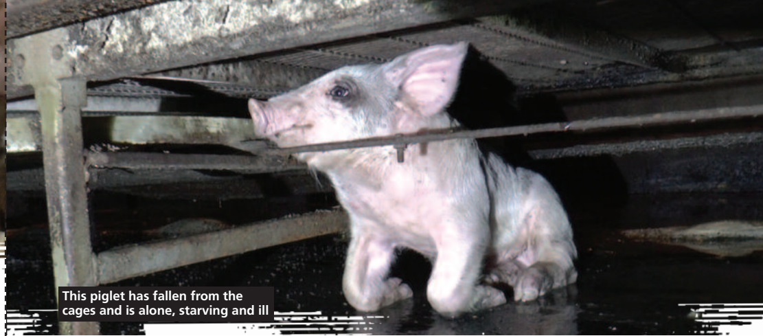
This piglet has fallen from the cages and is alone, starving and ill