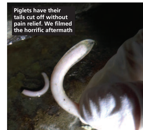
Piglets have their tails cut off without pain relief. We filmed the horrific aftermath

It wouldn't happen in the wild, but sometimes pigs on intensive farms resort to cannibalism. One terrified animal lay at the back of a pen unable to move, as another chewed on her leg. Her pain and terror must have been unimaginable.