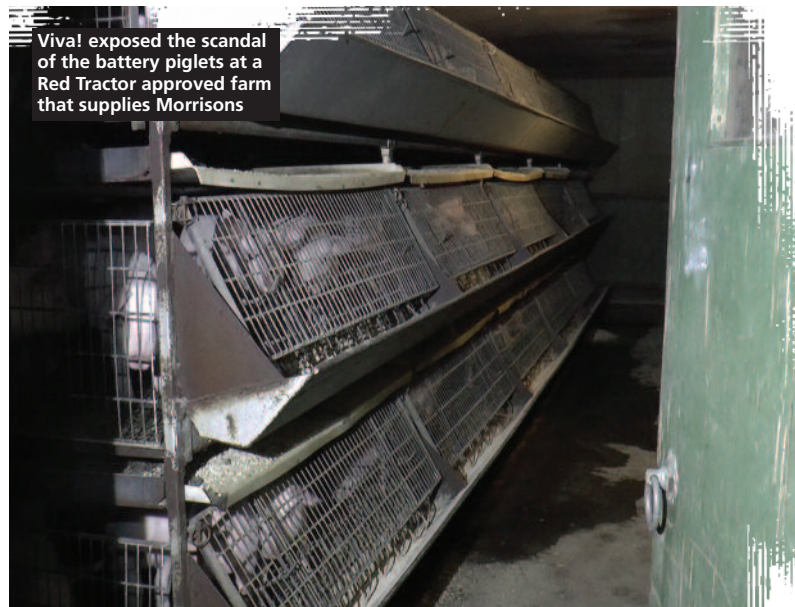
Viva! exposed the scandal of the battery piglets at a Red Tractor approved farm that supplies Morrisons

Viva! has investigated about 60 pig farms over the years and recently I visited a typical farm, Necton Hall, Norfolk in the black early hours of the morning. The doors of the first shed we came across were wide open and the lights had been left on. I walked inside, followed by a cameraman, to film about the desperate life of pigs. It was one of the most difficult experiences of my life.