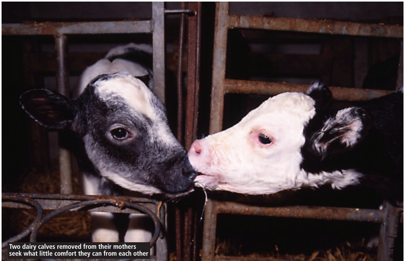
Two dairy calves removed from their mothers seek what little comfort they can from each other