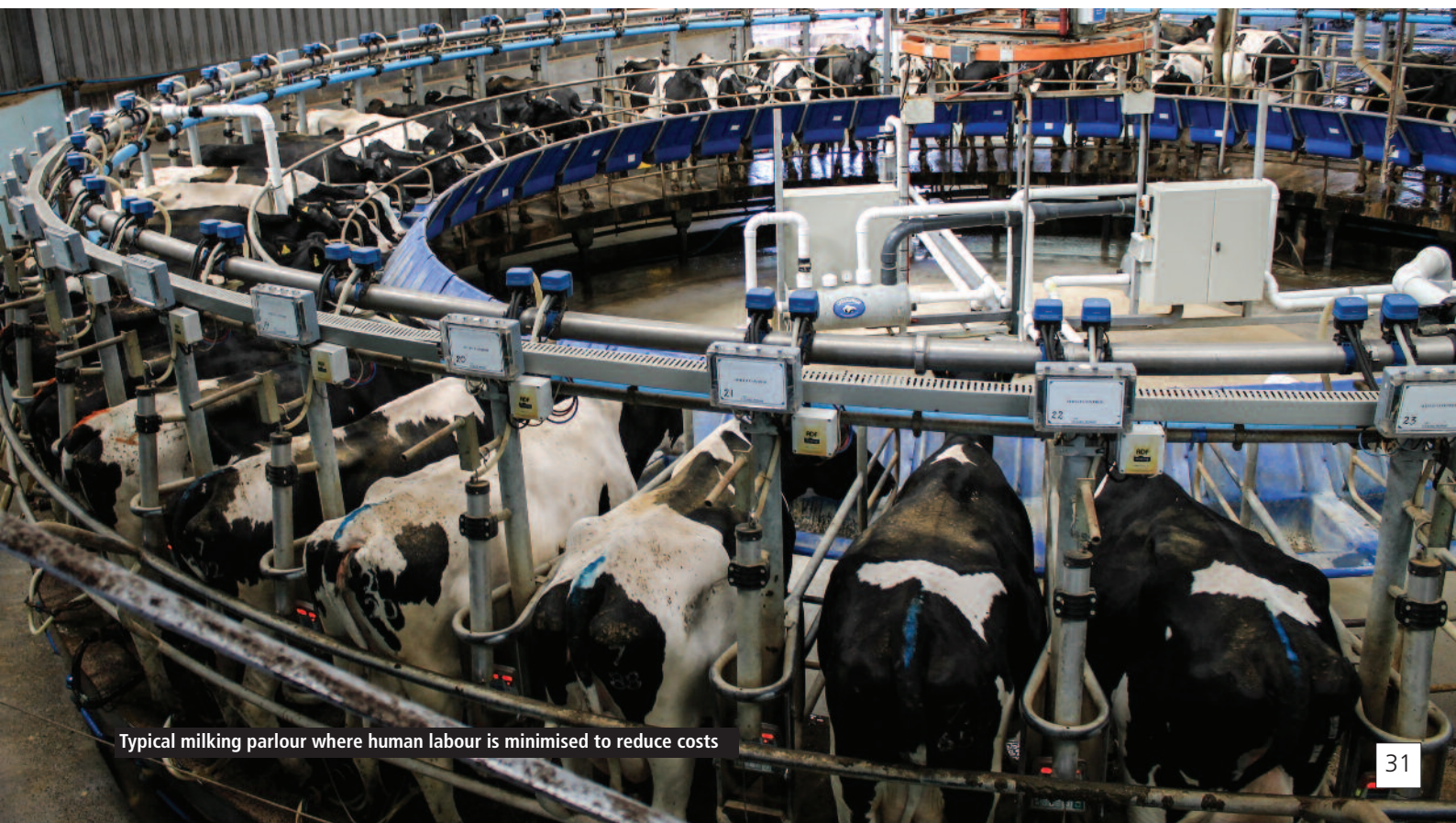
Typical milking parlour where human labour is minimised to reduce costs

Zero-grazing is feeding cattle with pasture plants and cattle feed in a system that does not involve any time at pasture. But as the report by the European Food Safety Authority stated: "If dairy cows are not kept on pasture for parts of the year, ie they are permanently on a zero-grazing system, there is an increased risk of lameness, hoof problems, teat tramp, mastitis, metritis, dystocia, ketosis, retained placenta and some bacterial infections." (92)