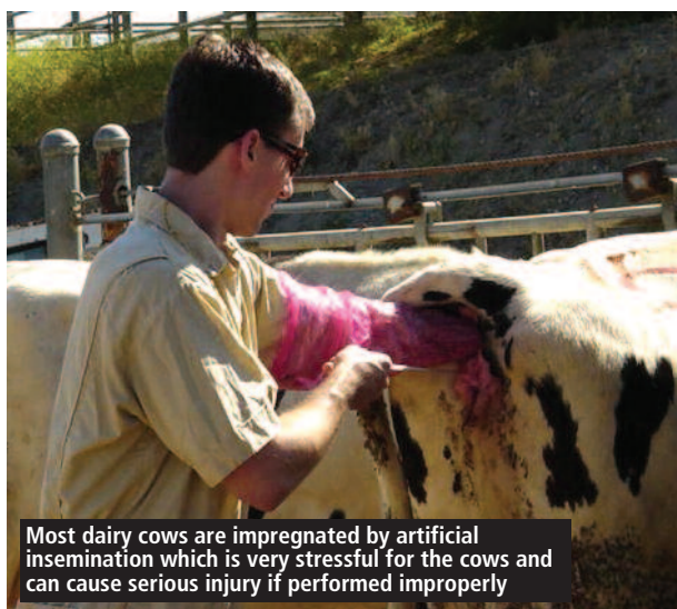
Most dairy cows are impregnated by artificial insemination which is very stressful for the cows and can cause serious injury if performed improperly

Embryo collection: 'high quality' cows are given a treatment to increase ovulation and then artificially inseminated in the usual manner (37). The resulting embryos (usually between seven and 12) are flushed from her uterus using a catheter type instrument (37). As this procedure takes place a week after oestrus (ovulation), the uterus is more difficult to penetrate than during artificial insemination and can result in bleeding and sometimes even uterine rupture (37). The procedure is so painful that UK law requires the use of an epidural (43).