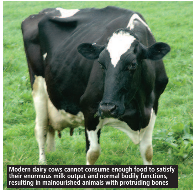
Modern dairy cows cannot consume enough food to satisfy their enormous milk output and normal bodily functions, resulting in malnourished animals with protruding bones

Excess mobilisation of fat can lead to a toxic level of ketones (by-products of fat breakdown) accumulating in the blood, milk and urine, causing a loss of appetite and drop in milk yield (70). Affected cows may also exhibit nervous signs, which include excessive salivation, licking of walls or gates, poor co-ordination and aggression (70). It is thought that