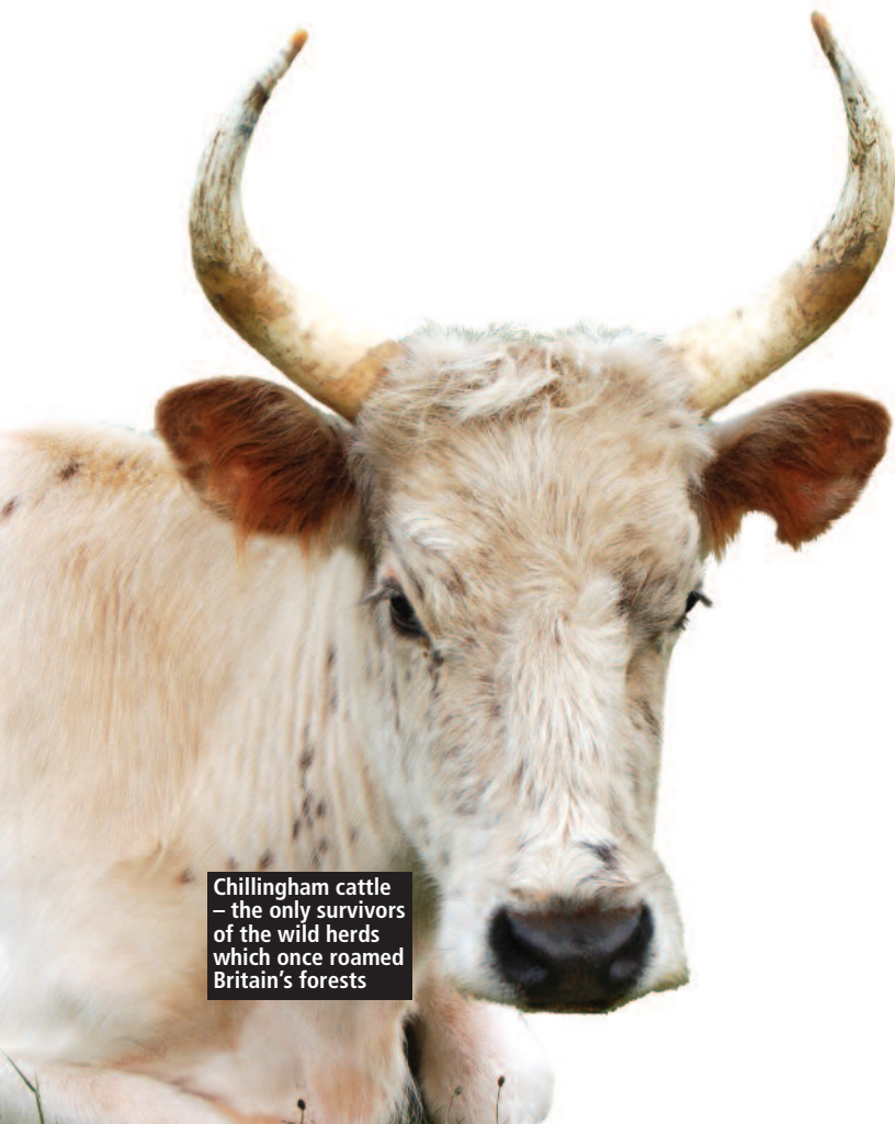
Chillingham cattle – the only survivors of the wild herds which once roamed Britain's forests

Cows are very protective of their young and will attack, and even kill, anything they see as a threat. Female calves will naturally suckle until they are around nine months old and stay with their mothers for the rest of their lives (21, 22). Males are weaned at around 12 months old and would then leave the herd and join a bachelor herd (21). Both males and females can easily live to be 20 years old (2), 21, 22).