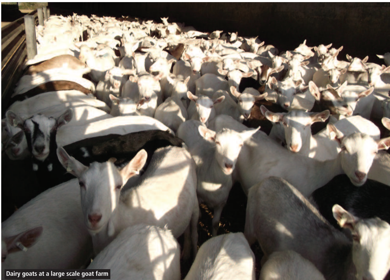
Dairy goats at a large scale goat farm

Goats are animals uniquely suited to thriving on tough, mountainous terrains but are increasingly kept indoors, for their entire lives, in massive zero or very limited grazing units. It's done for the ease of herd management and makes life easier for the farmers but it's certainly not good for the goats who are active and inquisitive animals and a confined life makes them suffer.